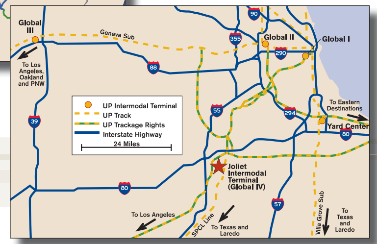
JIT is strategically located to competitively serve the Chicago metro market as well as nearby Ohio Valley locations.