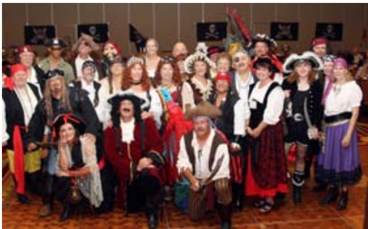
Costume contest participants