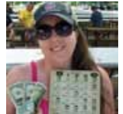
Bingo blackout winner