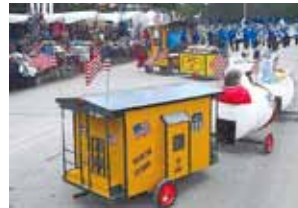
The Sept. 23 Warrens Cranberry Festival parade in Warrens, Wis., is one of five parades Club 77 members volunteer at from July to October.