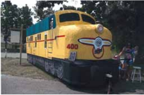
Using a pontoon boat trailer as its foundation, a modern-day replica of Locomotive 400 is created especially for the 2012 centennial celebration and Fourth of July parade in Adams, Wis.