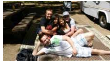
Members of Club 83, Sparks, Nev., enjoy a day at Frenchman Lake Recreation Area near Chilcoot, Calif., June 8.