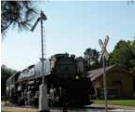
The UP Historical Society in Cheyenne, Wyo., boasts a steam stallion of earlier days — Challenger Locomotive 3977.