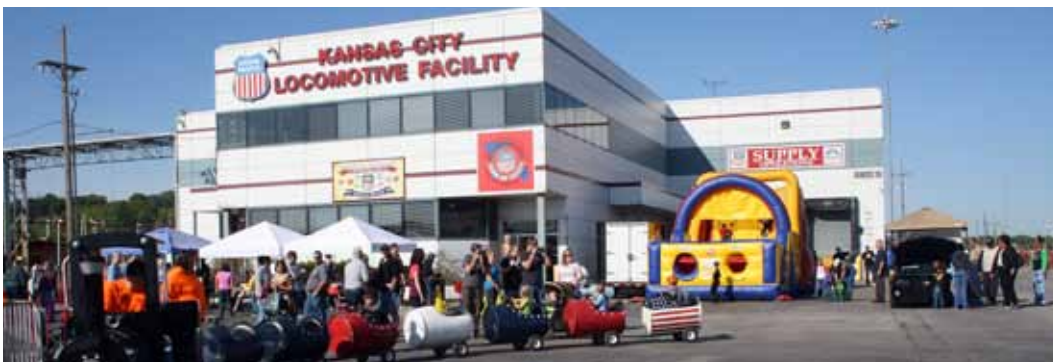
The Sept. 29 Kansas City Service Unit Family Day at Neff Yard attracts hundreds of railroaders and their family members.