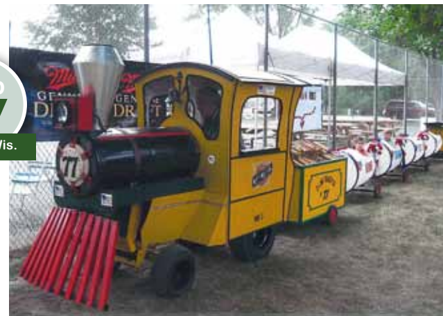
The Operation Lifesaver mini train attracts many youths June 25 at Burt Morris Park during the 2012 centennial celebration and Fourth of July parade in Adams, Wis.