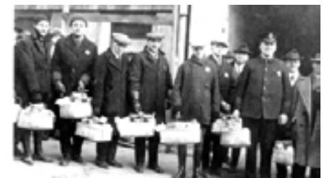
Volunteers of the Portland Police Reserve deliver baskets of food and clothing rations to impoverished local residents.