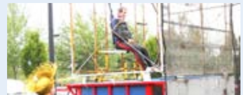
The dunk tank is a crowd favorite during the May 23 event.

Throughout 2013, as in past years, Club 9 will continue to seek donations of travel-sized toiletries, including soap, shampoo, lotion, mouthwash and toothpaste, for Fish Emergency Service, which offers temporary assistance to meet basic needs of Oregonians. The group already has collected 600 items at three local railroad locations.