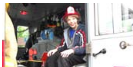
A new fire truck is a main attraction during the Sherwood School District's annual event for special-needs children.