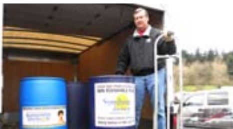
A representative of the Portland Police Bureau Sunshine Division collects donations March 21.