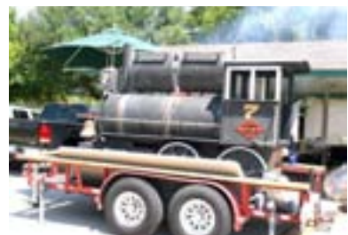
The grill was a hot commodity May 13 during the annual UPEC Friend to Friend Network golf tournament.