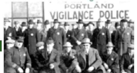
The Portland Police Bureau Sunshine Division was established by volunteers in the Portland Police Reserve in 1922.