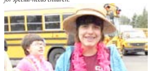
The Sherwood School District's annual event for special-needs children has plenty to offer youth and adults of all ages.