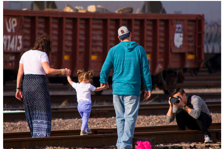
A photographer and a family of three are shown trespassing in Lesperance Street Yard in St. Louis.

"Unauthorized persons or trespassers on company property must be told to leave the premises, unless confronting the person(s) would be unsafe.