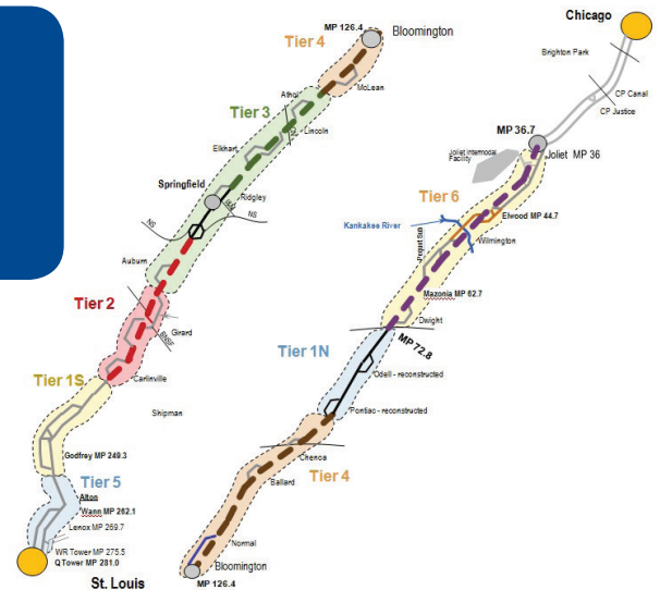
The project is separated into tiers to maximize progress and needs.

Telecom technicians will later install equipment including data switches in cabinets for signal transport.