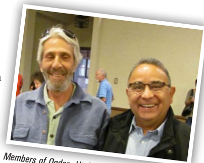
Members of Ogden, Utah's Club 6 enjoy a holiday gathering.

Club 6 also plans to host a charity drawing in March that will feature a smoker as the grand prize.