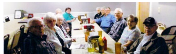
Club 28 members enjoy one another's company in October. In recent months, UPEC members from the Kansas City area have traveled two and a half hours to attend meetings.