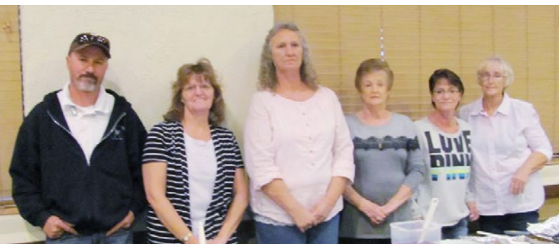
Club 6 is grateful to the Campbell family, who regularly cooks meals for gatherings.