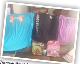
Through the Salvation Army's Angel Tree program, Club 8 makes two local children's holidays a bit brighter.

Members voted to give $150 to the Goodfellow Shoe Fund. For seven decades, the charity has purchased shoes and socks for impoverished children throughout Lincoln County. They also pulled two names from a local Salvation Army Angel