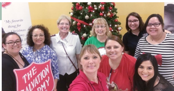
Club 66 members assist with the Salvation Army's Angel Tree program.

Club 66 members also continue to volunteer twice a month with a local food pantry. Volunteers assemble heavy bags — a shopping cart full of food, Featherling said — with items including produce and meat.