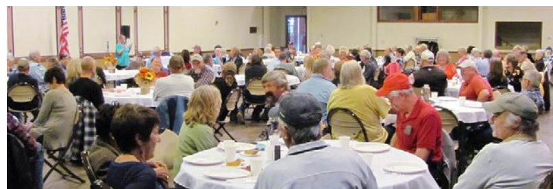
Members of Ogden, Utah's Club 6 enjoy their holiday gathering.