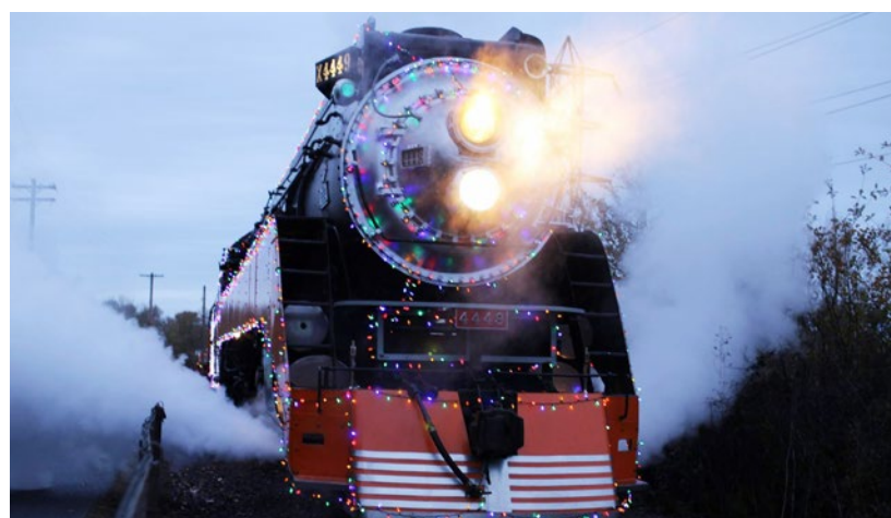
SP No. 4449, built in 1941, ran from Los Angeles to San Francisco over the scenic Coast Route and then on to Portland until its retirement in 1955. The 433-ton engine was restored in 1974 and has since pulled excursion trains and appeared in films.