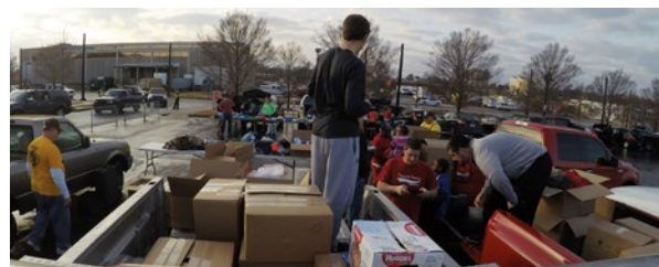
Low-income families pick up warm clothing, personal hygiene items and other necessities from volunteers at Little Rock's Christmas Caravan Dec. 17.