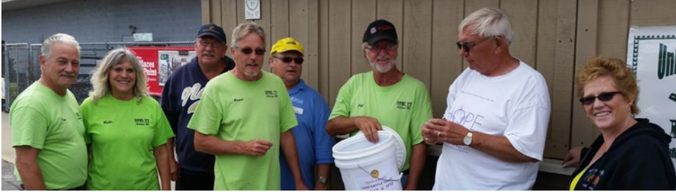
Club 77 members conduct a successful raffle in 2016.