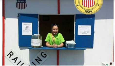
Club 77 raises money with a bratwurst stand.