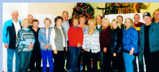
Club 70 of St. James, Minn., gathers for their December meeting.

A canned food drive was organized in conjunction with the event, helping some of Stumptown's less-fortunate citizens have a happier holiday season.