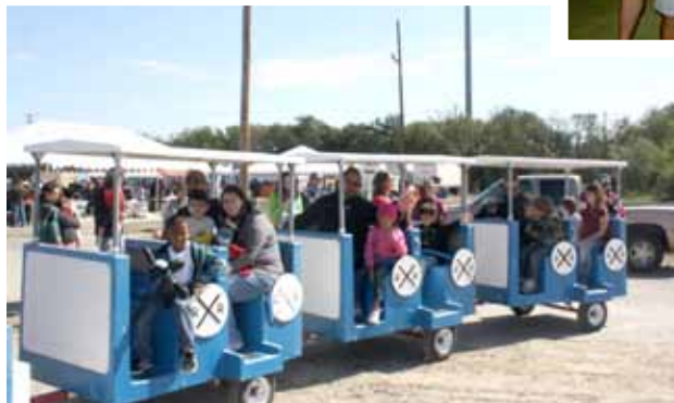
Attendees enjoy Family Day attractions, including a climbing wall and mini-train rides.