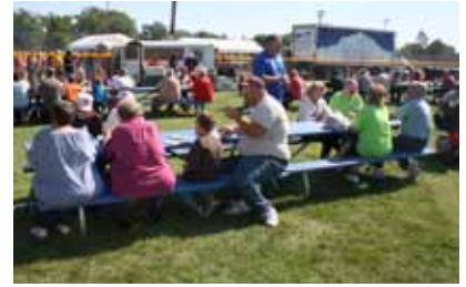
Employees enjoy an afternoon picnic Sept 15 during the North Platte Service Unit and North Platte Diesel Shop Family Day.