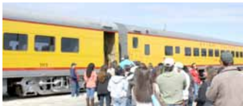
Families prepare to join President Abraham Lincoln for a ride throughout San Antonio on the Union Pacific Safety Train.