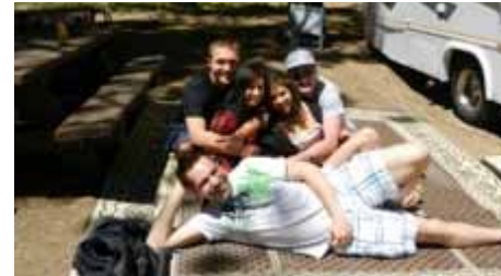
Members of Club 83, Sparks, Nev., enjoy a day at Frenchman Lake Recreation Area near Chilcoot, Calif., June 8.