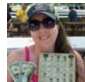
Bingo blackout winner