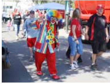
A clown waves from the Rail Fest midway.