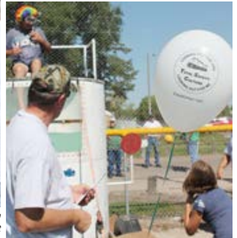
Managers volunteer at a dunk tank, allowing children of all ages to purchase chances to make a splash. Proceeds from the dunk tank went to Friend to Friend Network.