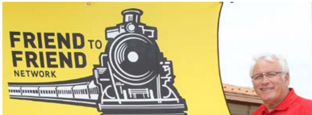
Continued on page 8

Friend to Friend was born out of the Union Pacific Employee Club Executive