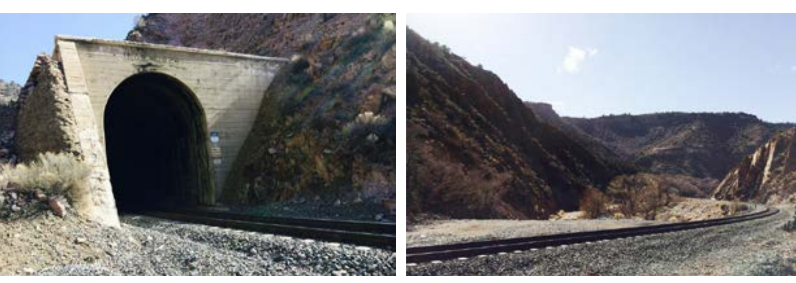
Remote territory presents challenge for fiber installation. Fifty miles will be constructed along the Caliente Subdivision in Nevada and Utah.